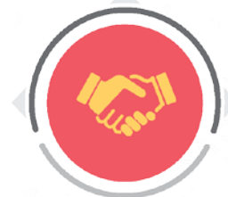
EMPLOYERS NOT LOBBYING FOR CHANGE