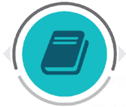
LICENSING, CLAIMS ACT